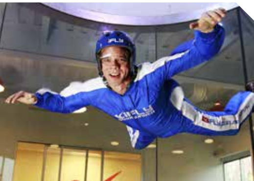
OTHER RECREATION — IFLY