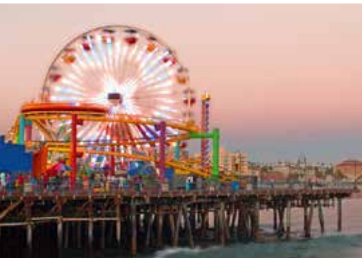
ATTRACTIONS — SANTA MONICA PIER