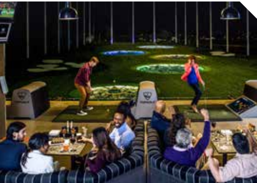
GOLF ENTERTAINMENT COMPLEXES — TOPGOLF